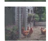
Community organic farm