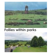
Follies within parks