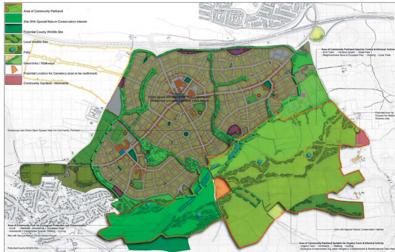
Sherford: proposed community park and parkland

Habitat diversification and protection will also be high on the agenda and whilst the aim is to ensure that habitat creation occurs throughout the park, there would be specific areas where ecology is the priority. This would include: