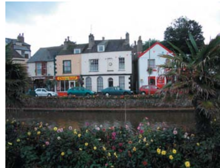
Local character examples