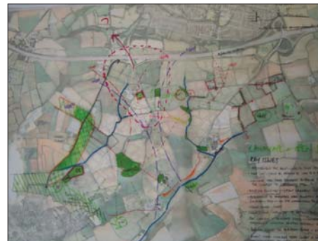
Sherford studies: landscape features to retain

The Community Steering Group were provided with a digital camera and asked to take photographs of their favourite buildings or parts of their community for inclusion within the Sherford Design Code. We wanted to make sure that the local vernacular was incorporated within the design of Sherford and this is best expressed by the existing residents of the local communities.