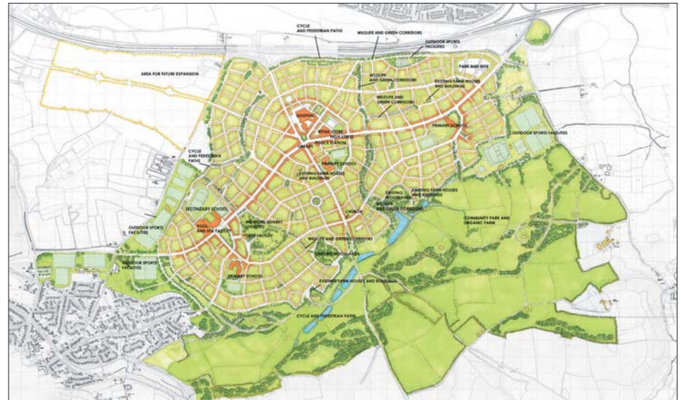
What does Sherford offer? The proposed facilities

It is envisaged that the Trust will also employ staff to promote more sustainable and healthy lifestyles, addressing issues such as, personal travel plans, waste minimisation and recycling, raising the awareness of local food, engendering civic pride and community involvement.