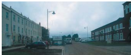
Poundbury: the factory built first followed by houses opposite