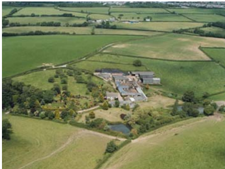
Sherford valley and watercourse: a place for the new community park

The Sherford watercourse in the bottom of the valley is the landscape feature that logically offers the eastern growth boundary. Therefore, the Sherford plan creates a public park in the valley floor and on the eastern slopes. Town and country distinct from one another, but both working together.