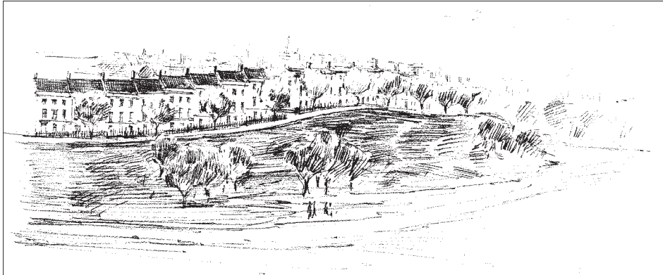
Sherford valley: the type of buildings that might create the new urban edge

Together with Devon County Council, Plymouth City Council, South Hams District Council, local parishes and communities, there have been some passionate debates. It was felt that a boundary needed to be established that would define a clear edge between town and country for many years to come. This would mean that any further expansion would work back towards Plymouth once the quarries were exhausted.