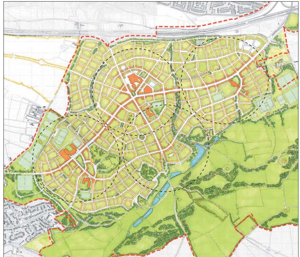
Sherford walkable neighbourhoods diagram 450m radius neighbourhood centres