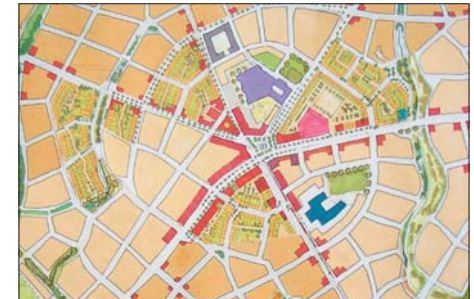
Sherford: a detail of central neighbourhood showing the interconnected public streets, square and green corridors