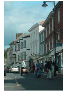
Kingsbridge High Street