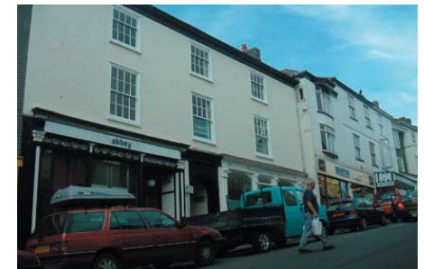
Kingsbridge High Street