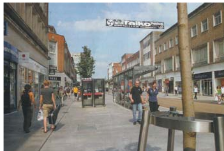
How not to do it