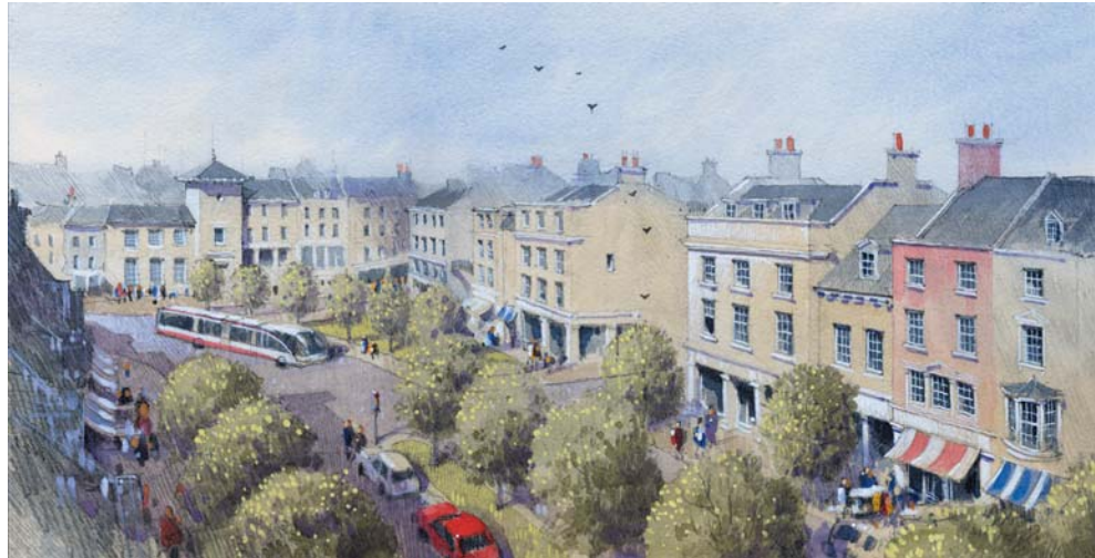
Sherford: a perspective of the proposed High Street

High Streets were always where local people and visitors came together. The passing trade helped those facilities survive for the benefit of local people. It was also the place where social and leisure facilities were located for the very same reason. The link from the A38 to the A379 will make a terrific contribution to the number of local facilities Sherford can support. As with any successful High Street, traffic has to be managed and tamed. But the benefits far outweigh the problems.