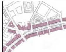
Sherford: proposed High Street