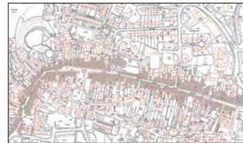
Totnes High Street