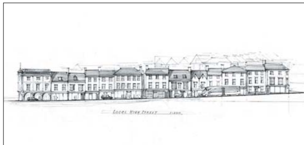
Sherford: proposed elevation for a new High Street