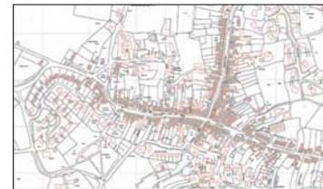
Modbury High Street