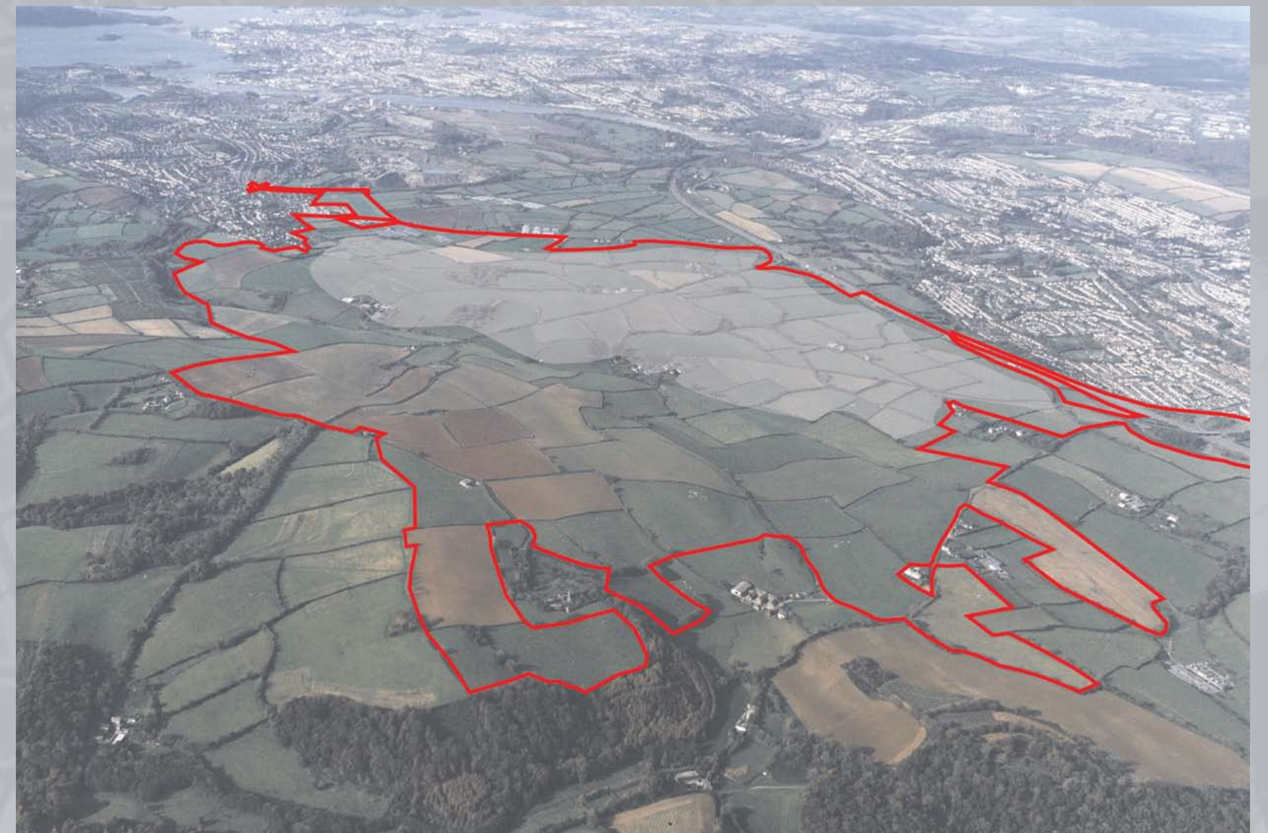
Aerial Photograph of the Site – assimilation into the landscape (ref Masterplan Book)

Sherford will deliver a highly sustainable urban extension to Plymouth, with the logic of a traditional market town. This will include up to 5,500 new homes and up to 7,000 new jobs.