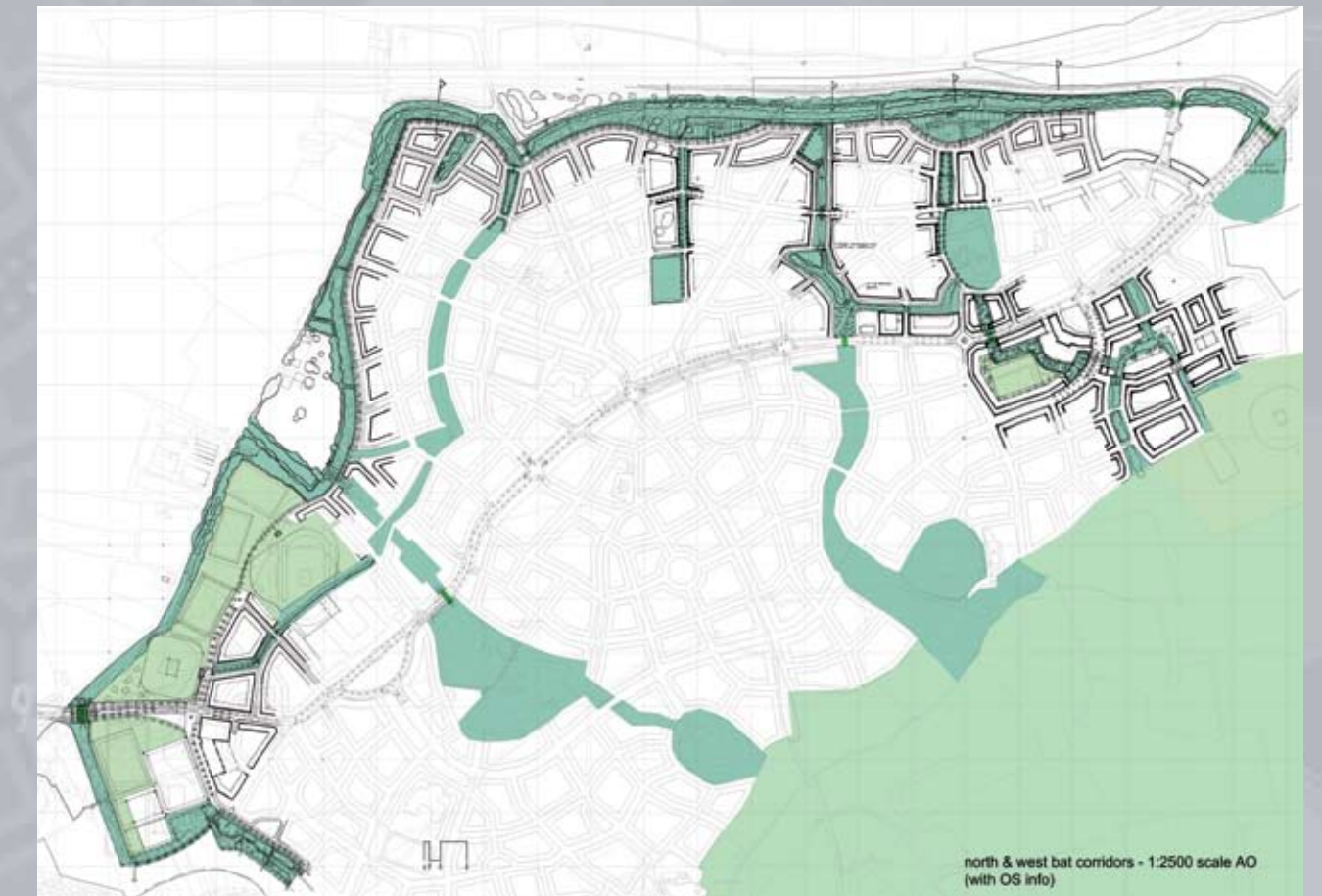
Wildlife and Bat Corridors (ref Environmental Statement addendum)

The open space at Sherford will include a 207 hectare community Park - which will be the largest habitat creation scheme in the South West, equivalent in size to around 300 football pitches - as well as 70 hectares of woodland.